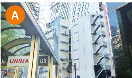
A From Unimall, the No.5 Exit is most convenient.